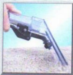
Spot and Upholstery Tool Clear view upholstery tool with precision spray nozzle.